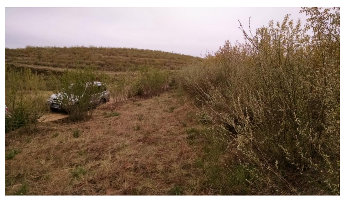
Picture 3: With programme: Haiyuan County, Ningxia, May 2015. This photo shows how the mixed planting of shrubs (ningchao and xiaji) and almond trees supported by ECPRP has led to a strong recovery of the vegetative cover on 8,900 mu of land in Huanzhuang Township. In combination with government subsidies of CNY 160 per mu (which are guaranteed for 16 years), programme area farmers have enjoyed substantial financial gains following conversion of these previously cropped lands.

93. Overall , this PPA concludes that while the government's land retirement, grazing prohibition, reforestation, and other environmental protection programmes played the primary role in the profound environmental recovery across the Loess Plateau, a range of ECPRPNS activities were fully consistent with and significantly supported environmental conservation in the programme area. The performance is rated moderately satisfactory (4).