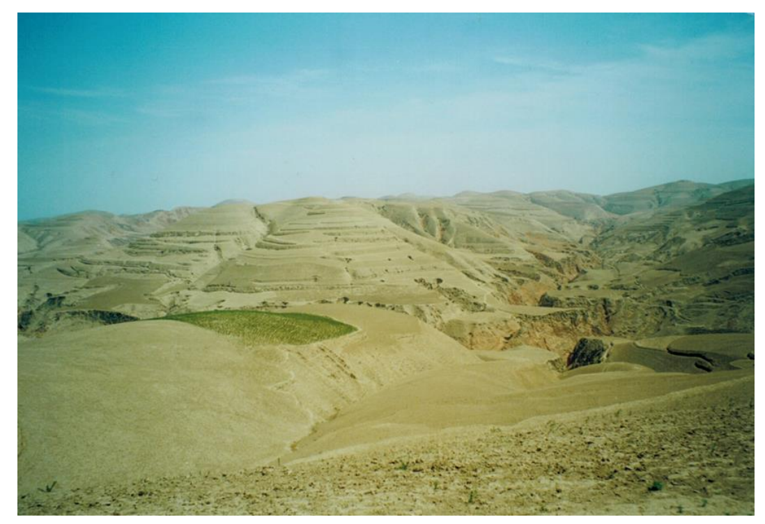
Picture 2: Before programme: Haiyuan County, Ningxia, May 2000. This photo shows the near complete devegetation and extreme soil erosion typical in the Xihaigu area due to extensive cropping and overgrazing on steeply sloped Loess soils.