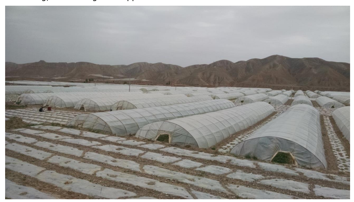
Picture 1: Successful programme greenhouses in Fengwan Township in Haiyuan County, Ningxia. Benefiting from strong and sustained technical, marketing, and managerial support, the greenhouse production of peppers and sweet melons is highly profitable, and has served to greatly increase the cash income of the 120 participating programme households.

Component 2: Financial services. The financial services component was intended to address the "lack of credit, in particular to purchase appropriate inputs," which was identified as one of the seven main causes of poverty in the appraisal document. The objective of this component was to improve access to financial services for the poor and women. Funding was intended to target