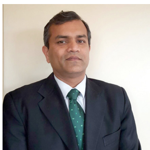
Mr Vimlendra Sharan, Minister (Agriculture) and Alternate Permanent Representative of the Republic of India to the United Nations food and agriculture agencies in Rome and Chairperson of IFAD's Evaluation Committee