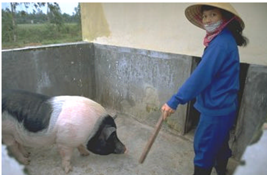
Beneficiary working at a pig-breeding station in Duc Ninh Commune. The facility was built in 1999 with funds from the project. Pure-bred Vietnamese sows and boars are raised and sold throughout Quang Binh Province.

79. The sustainability of the afforestation SMBs is less clear and the mission found some cases where the SMB had simply disappeared after the completion of the plantation and initial period of tending the trees. These SMBs were motivated, predictably enough, by the aim of completing the tasks and collecting the remuneration. Once this had been achieved, there seemed no reason for them to continue. This problem is clearly linked with that of payments for forest protection. In some cases at least, these payments appear to have ceased, or to have been unnecessarily delayed. The modification in project design referred to earlier ( para. 23 ) necessitates the continuation of protection payments if the forest is not to be ravaged by collectors of fuelwood. It would be pleasant to believe that the forests would be protected by the local people simply because of their awareness of their value in terms of water, soil and climate. Such appears to be the case in the immediate vicinity of villages, but elsewhere other inducements are necessary.