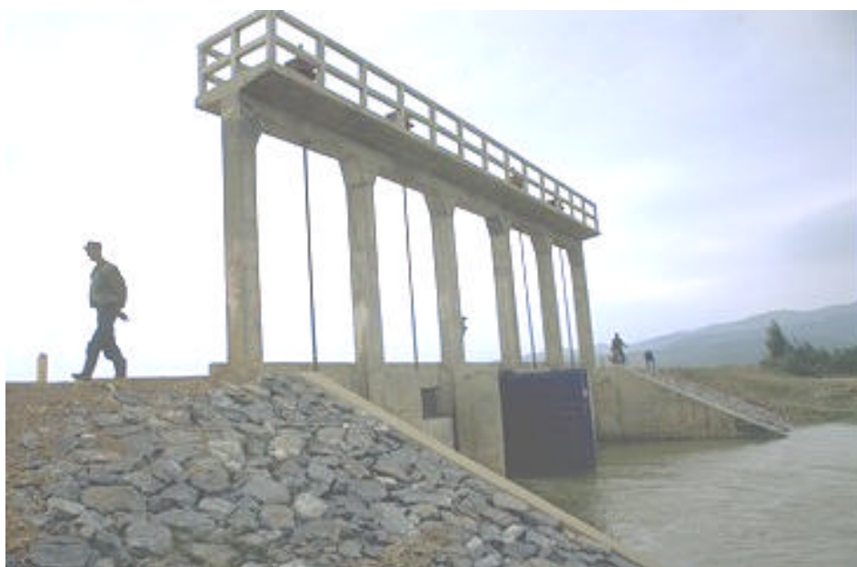
Truc Ly sluice canal system outside of Ham Ninh pump station in Quang Ninh district. The canal system, located at the entrance of an irrigated rice paddy, helps regulate water levels during wet and dry seasons.