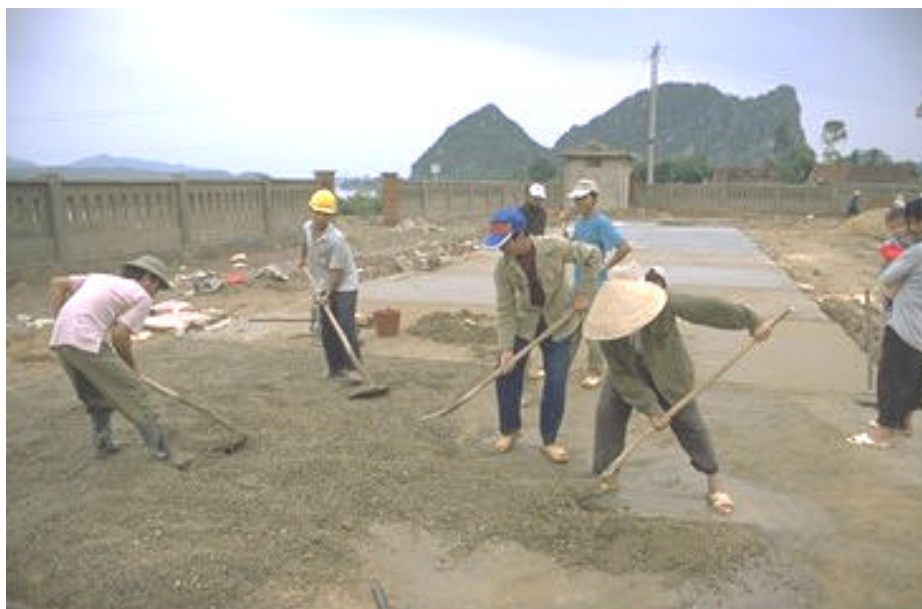
Beneficiaries on construction site of the Xuan Son rural market in Son Trach commune, Bo Trach district. The market will provide villagers a common place to sell their goods.

8. Two important conditions should be noted: (i) the project had been closed for around fourteen months at the time of the Interim Evaluation Mission. Thus the technical implementation units and some of the grassroots organizations set up under the project were no longer functioning, and the project management unit consisted only of a residual presence now funded by the province; (ii) no independent impact assessment or household survey had been commissioned by the project. While the official commune-level statistics available are remarkably full, the trends that can be observed therein result from a multiplicity of interventions of which ARCDP is only one.