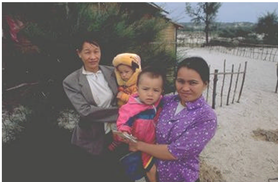
Beneficiaries on road in Ngu Thuy. The road was completed in May 2000 and provides 3700 villagers access to the market and to other villages.

41. Procurements and Financial Management. The project management has strictly followed the regulations set by the Government and the guidelines given in the appraisal report with regard to the procurement of goods, including tendering, tender evaluation, fund withdrawals and reporting systems. During implementation, ARCDP suggested ways of abbreviating the process for withdrawal applications. Independent auditing, implemented by international audit companies through bidding, was scrupulously carried out, and financial and annual M&E reports were submitted as required.