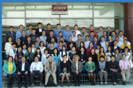
Methodology workshop, Beijing, July 2014 SHIPDET, Shanghai, Spring 2015

Development of Ethiopia evaluation standards