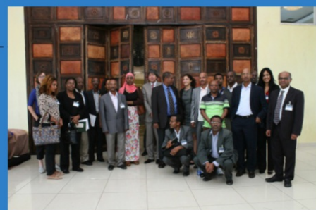
ECD Workshop, Addis Ababa, November 2015