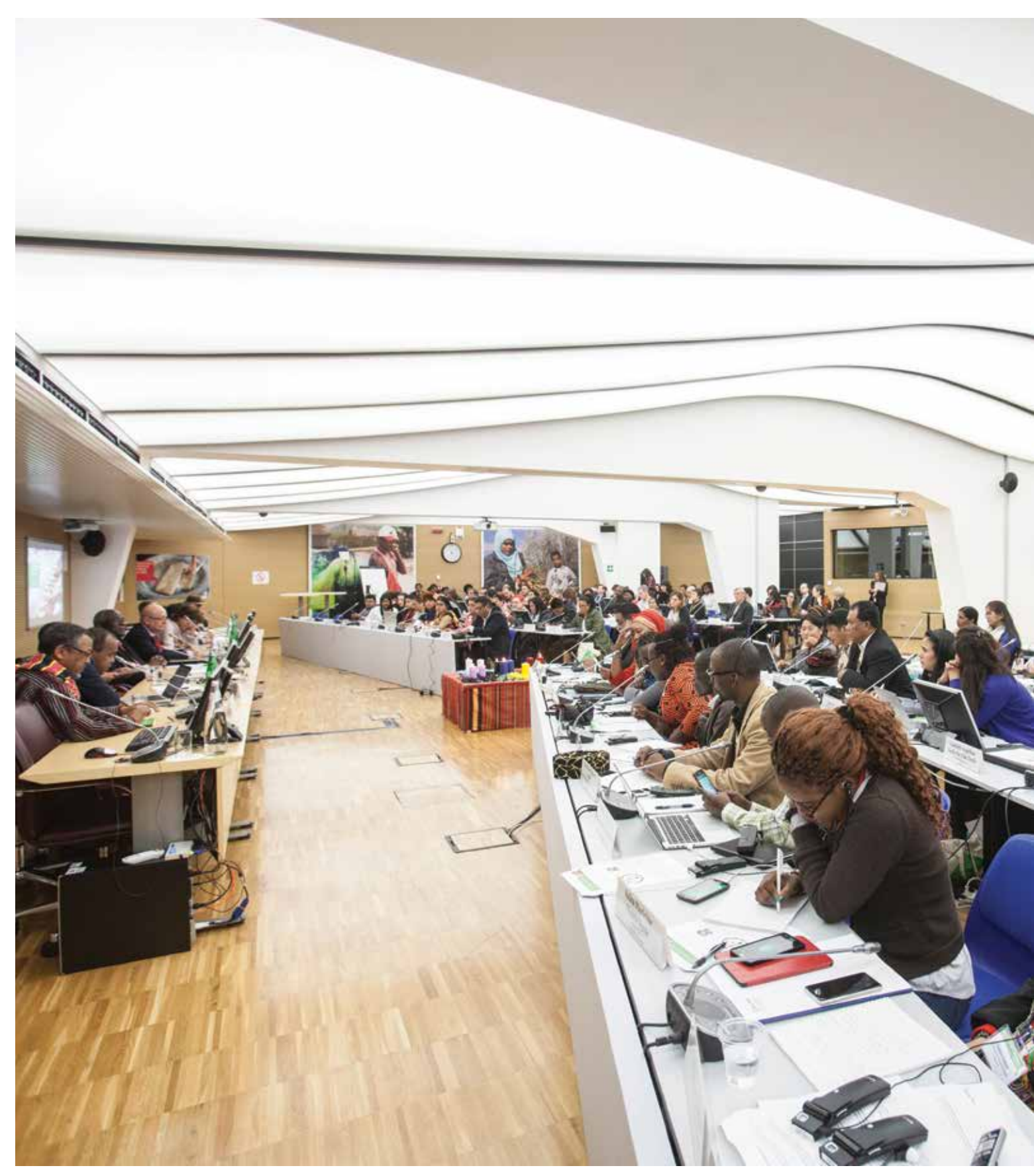
Opening session of the Forum