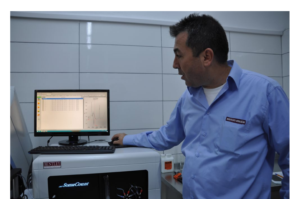
The somatic cell count instrument is the newest piece of milk analysis equipment acquired by the ECBA.

The project also supported training programmes, the establishment of a milk collection network and the distribution of necessary equipment. ECBA's milk collection network consists of one main collection centre that can hold 15,000 L, and eight smaller collection points, each with a 1,000 L capacity.