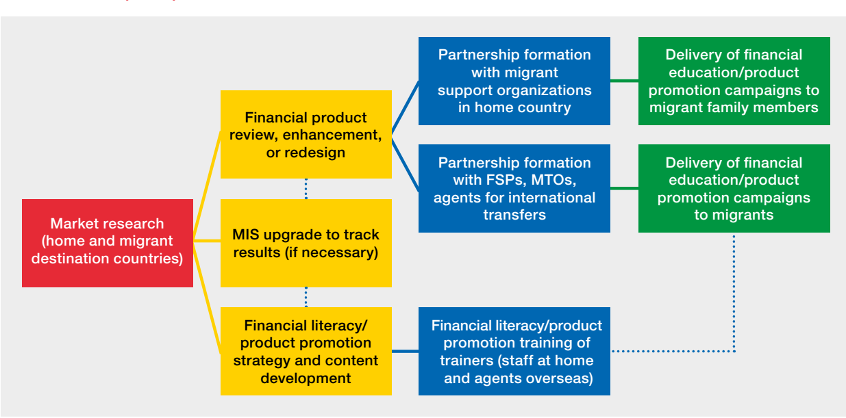
FIGURE 2 Steps required to launch an inclusive remittances business line