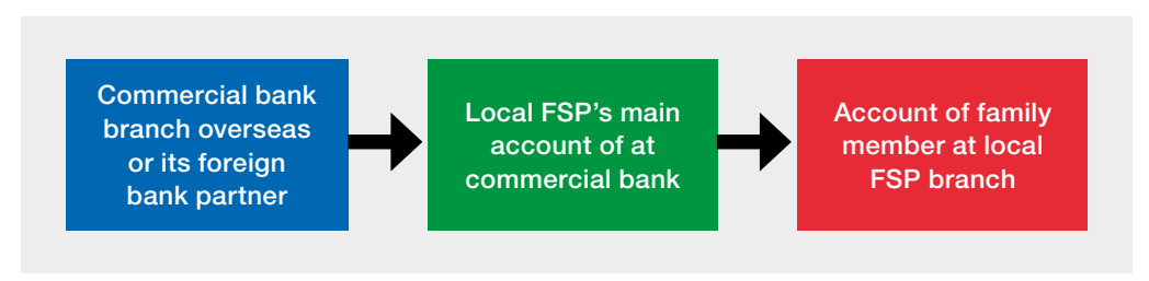
FIGURE 3 Generic model of direct-to-account remittance

Although money transfers through banks have traditionally been expensive, many now have online banking systems with competitive rates. Most of the major banks in the destination countries have an online banking system (and sometimes e-wallets) that enables migrant workers to send money to banks in the origin country.