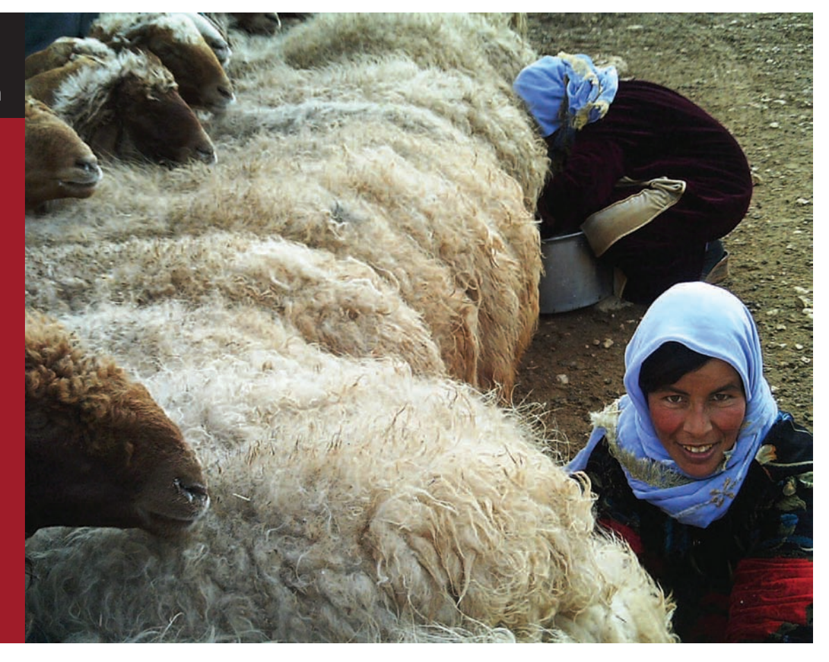
Livestock Thematic Papers Tools for project design