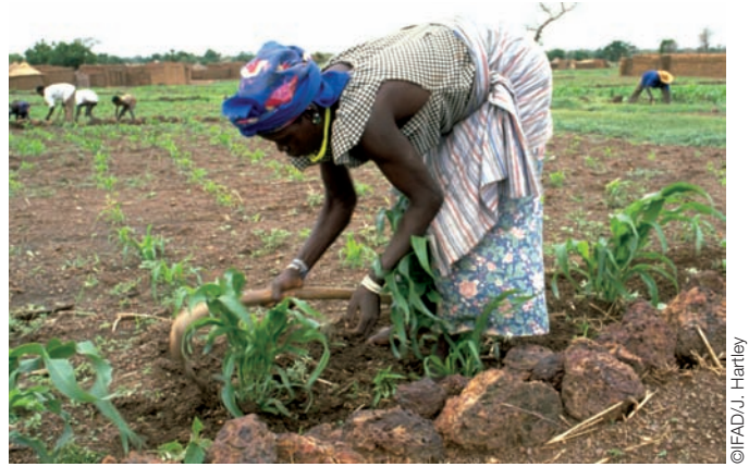
Woman from the Ouro village near Ouahigouya, weeding millet planted

some studies, with organic matter content increasing from 1 to 1.4 per cent and nitrogen increasing from 0.05 to 0.8 per cent.