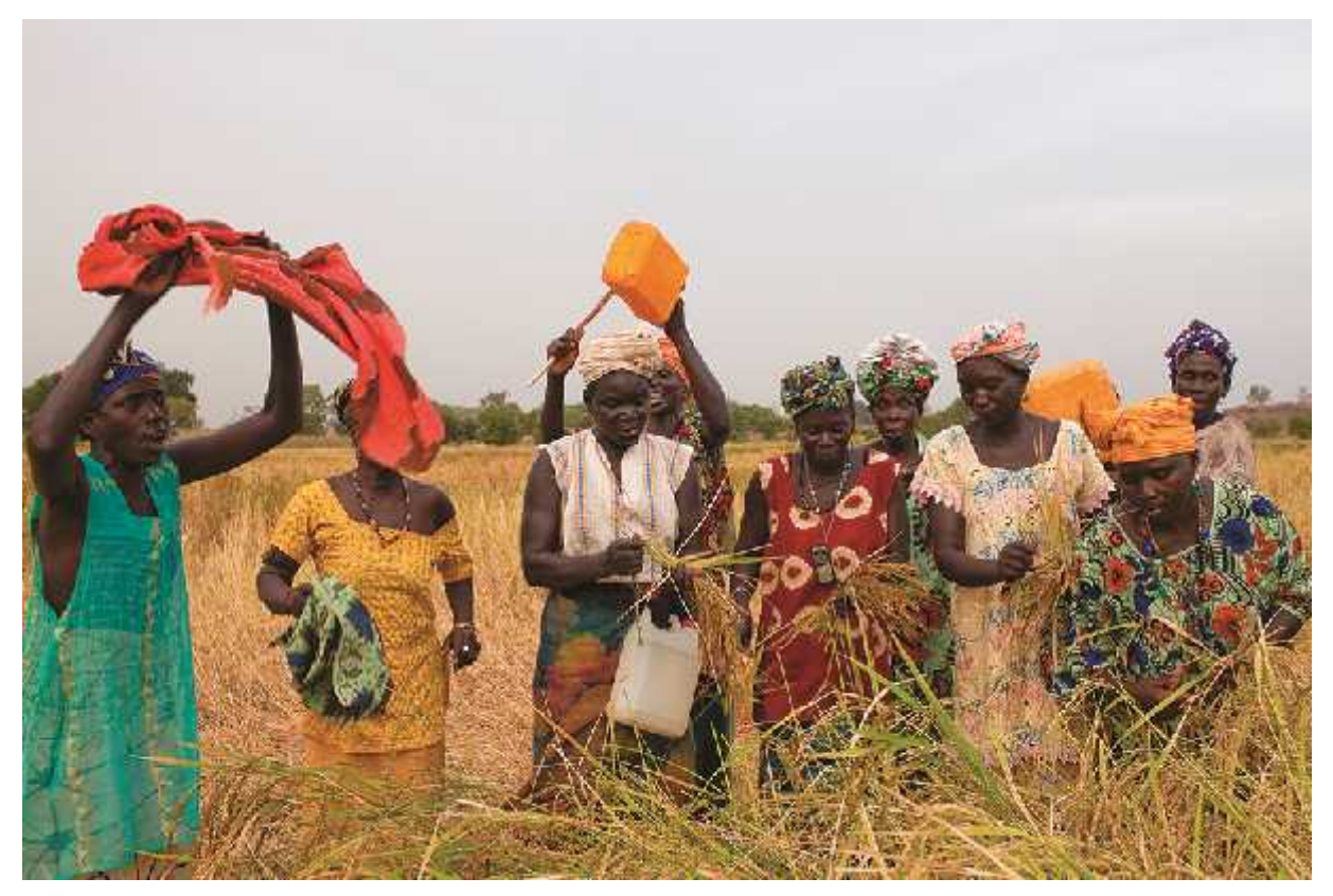
The Gambia - Participatory Integrated-Watershed Management Project (PIWAMP)

Insufficient coordination among stakeholders. The uptake and use of DFS by smallholders call for an environment in which DFSs are widely used. But the formation of such an environment requires coordination among a variety of stakeholders, which is developing in only a few countries.