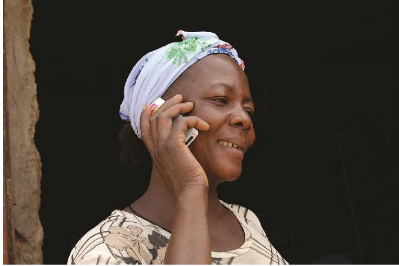
Burkina Faso - Rural Microenterprise Support Project