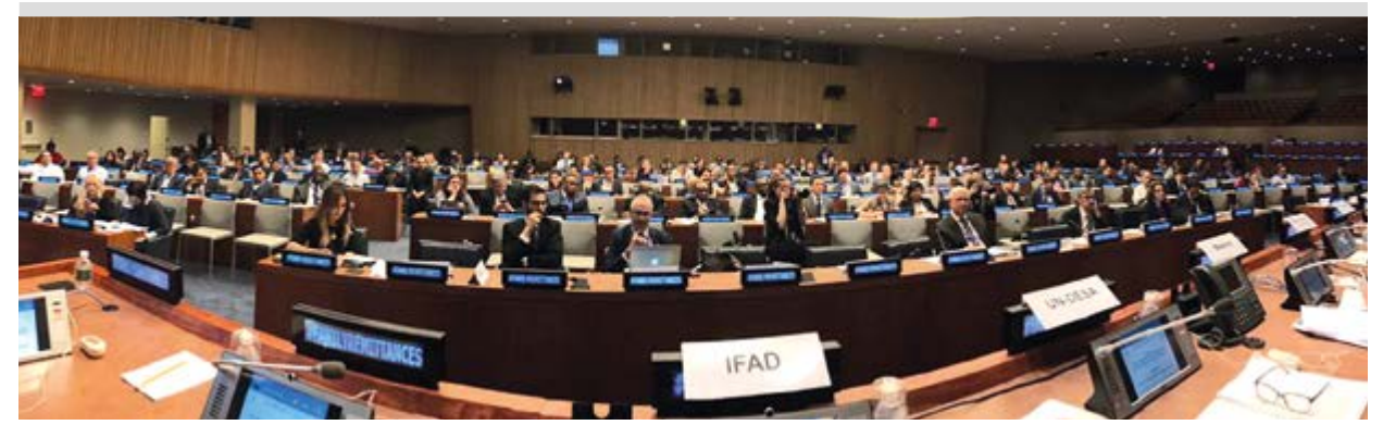
United Nations Headquarters Conference Room 4 on 16 June