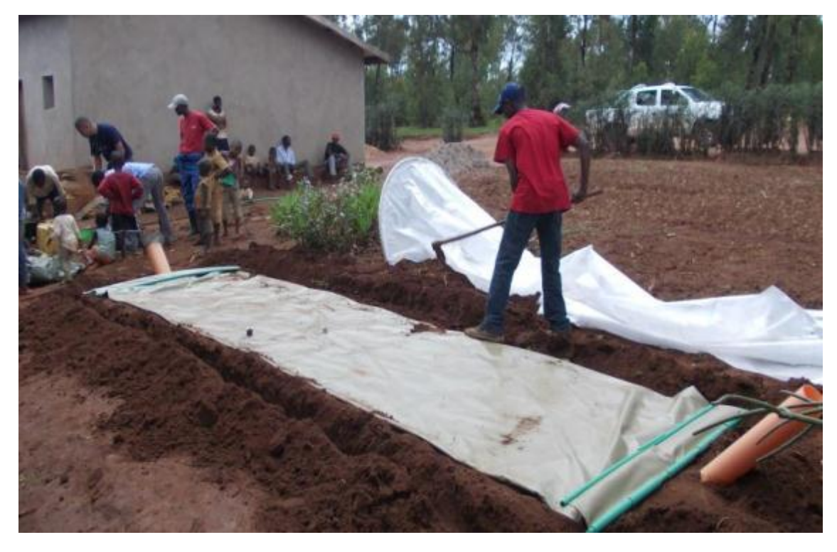
STEP 2: Roll out the digester envelope