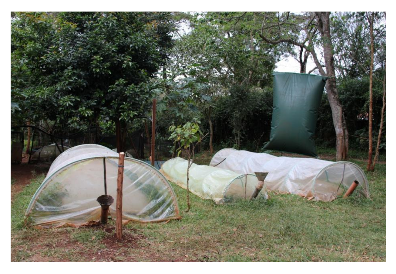
Flexi Biogas system with surplus gas storage balloon