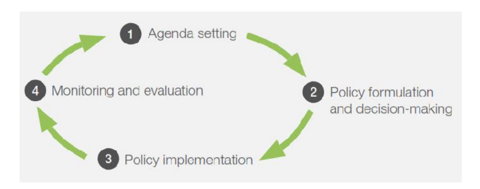
Figure 1. Policy cycle

Many of these dimensions may be relevant to the same set of issues. Take the example of agricultural extension. There may be a national extension strategy, a national extension programme, a budgetary allocation for it, a dedicated institution for agricultural extension and an application of the strategy through a series of smaller policies at the local level. However, there is not always a consistency among these levels, and pieces of the policy "hierarchy" might be missing.