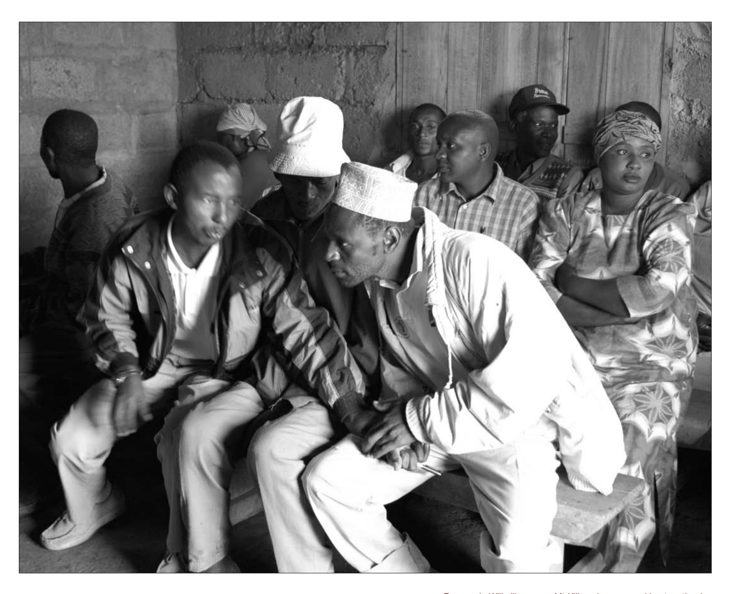
Farmers in Wili village near Mt Kilimanjaro are working together in groups that meet regularly to discuss issues of common concern.

face discussions. The Internet will also allow them to get feedback from others like themselves who might live very far away."