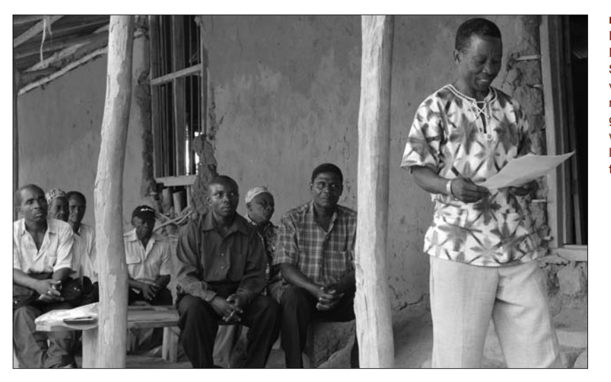
Members of the Nkumba Agricultural Marketing Co-operative Society in Kwamhosi village, Muheza district, meet to discuss how to get the information that will help them sell their locally-grown spices for the best price.

Experiences with these market investigators have been shared between districts, with the result that shu shu shus are popping up all over the country.