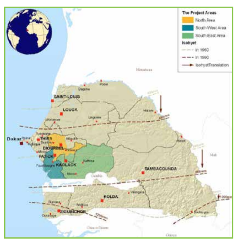
Figure 1: Isohyet slippage in Senegal

This component is targeting national stakeholders, policymakers and local-level actors to create awareness of the implications of climate change on agricultural production and pastoral farming, as well as on key value chains. For example, four regional workshops were organized with the regional climate change committees to inform stakeholders about the National Adaptation Plan of Action and to better define the adaptation needs of target groups. These workshops in the Kaffrine, Kaolack, Fatick and Diourbel regions had high visibility. But sensitization also targeted producers themselves, whose confidence, especially that of young and women producers, has been restored; pleased with the results of their activities, they are now proactively articulating their needs to improve productivity.