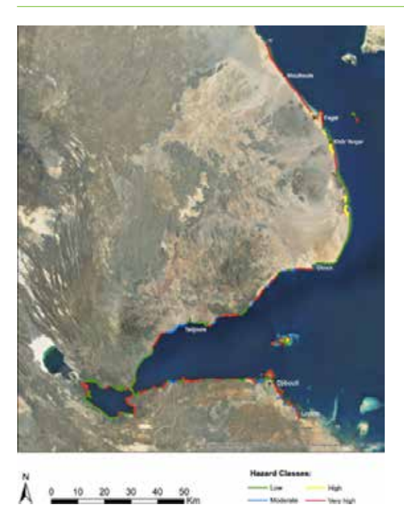
Figure 1: Ecosystem disruption hazards map for Djibouti