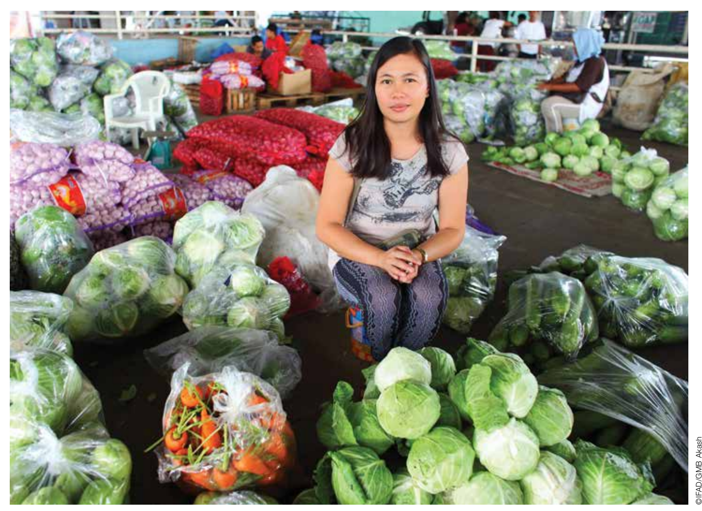
IFAD enables indigenous peoples and other marginalized groups to improve their livelihoods. Philippines

IFAD is unique in being both an international financial institution and a specialized United Nations agency. It is also unique in mandate – the only institution exclusively dedicated to eradicating hunger and poverty in rural areas of developing countries. IFAD provides low-interest loans and grants to developing countries to finance innovative agricultural and rural development programmes and projects, and is among the top multilateral institutions working in agriculture in Africa.