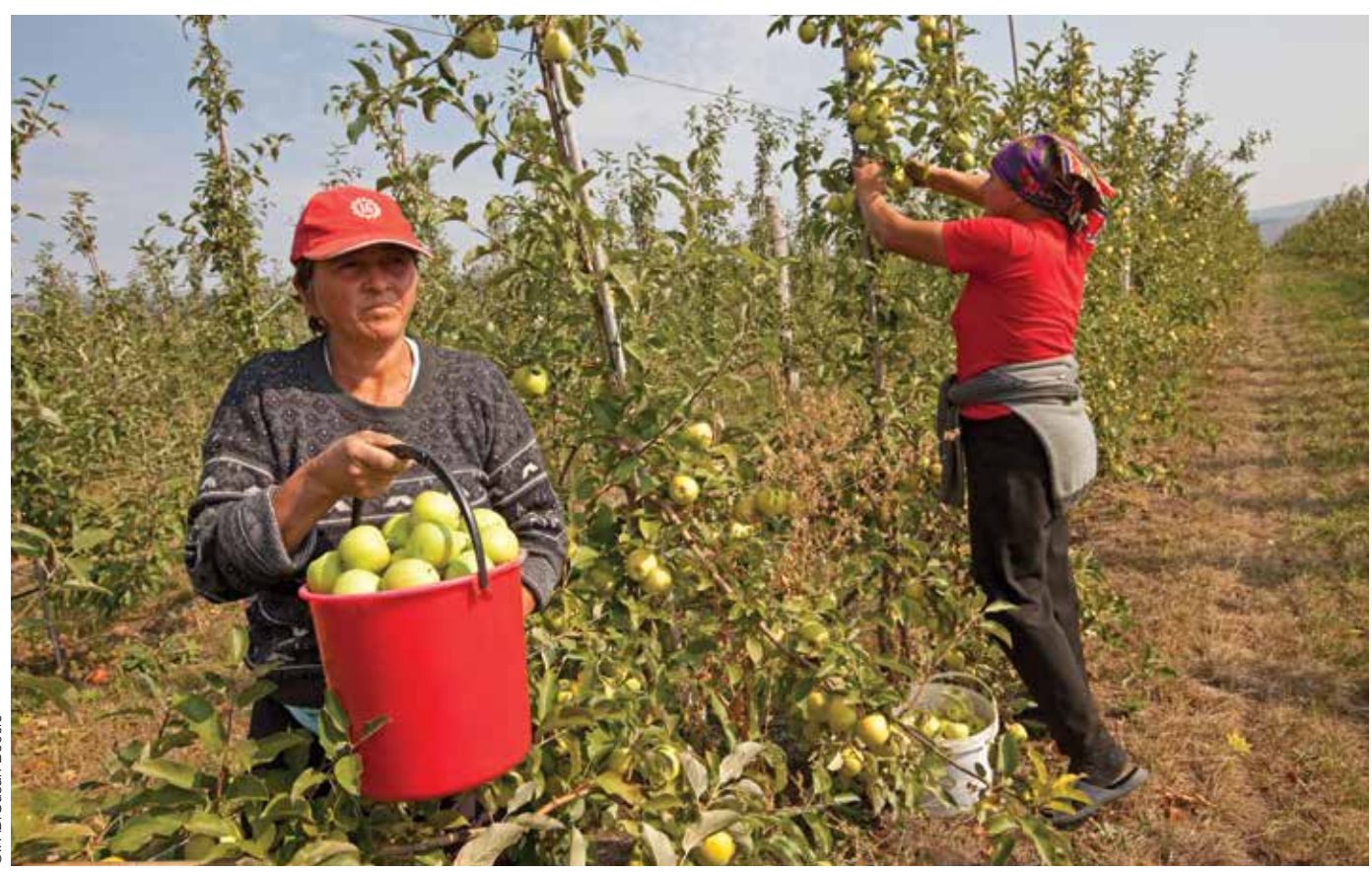
IFAD helps rural people and their organizations connect to value chains to increase their incomes. Moldova

Italy is a key partner for IFAD, not just as the host country and a top donor but also as a long-standing leader in financial innovation, agriculture and food security. Since IFAD's establishment, Italy has played a crucial role in contributing to the organization's resources as well as in welcoming 520 staff from IFAD's 176 Member States. Every year during the IFAD Governing Council, Italy facilitates delegations from all around the world, and representatives of farmers and indigenous peoples' organizations to convene in Rome. With US$1.7 million in Italian supplementary funds, IFAD has hired 58 Italian experts through 142 contracts over the period 2009-2015.