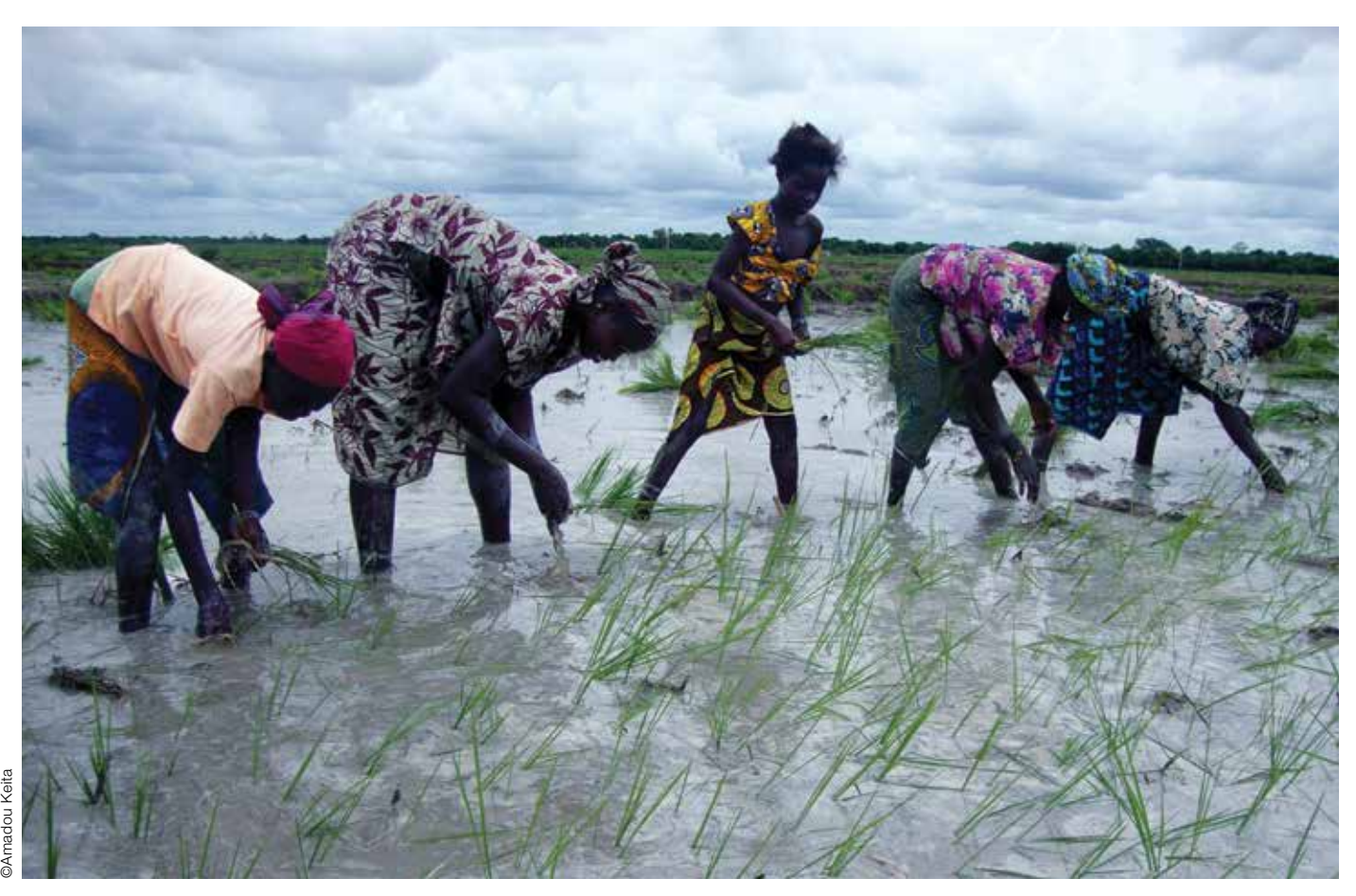
IFAD works with rural women to help them gain secure access to land, finance, knowledge and other resources. Mali

to Farmers' Organizations in Africa Programme, today funded with US$40 million from the European Commission, the Government of Switzerland and the Government of France.