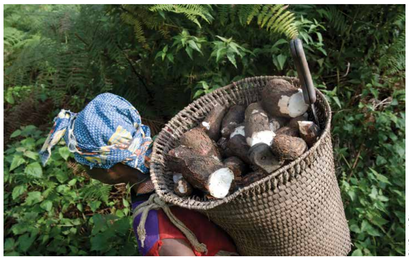
IFAD-supported projects have helped farmers improve processing and marketing of cassava – a major source of dietary energy for half a billion people. Gabon

Italy and IFAD have collaborated to increase the resilience and risk management capacity of rural people in a number of ways. For example, with US$1.1 million of Italian supplementary funds, projects in Niger and Sudan have helped increase the climate resilience of smallholders through the use of tolerant or resistant crop varieties, ecosystem restoration, and sustainable land management practices. Under the RuralFin Facility, warehouse receipt schemes were introduced in Burkina Faso and Mauritania to address food crop and agricultural input price fluctuations over the year.