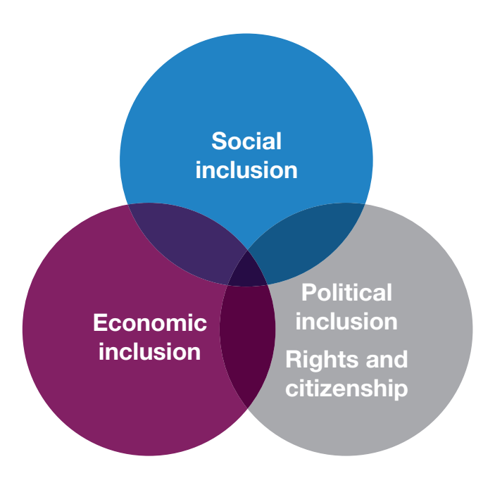
Figure 1 Inclusion: three main interrelated domains

For poor or marginalized groups, getting successfully involved in collective action increases confidence and self-esteem while improving living conditions. Organizing relies on the rationale of increasing bargaining power within the economic sphere. However, although material conditions matter, the impact of collective action is intrinsically linked with uplifting individual and social capacities to act differently and challenge the distribution of power that constrains the capabilities of poor and marginalized groups. By organizing, individuals benefit from capacity-building that increases individual and collective agency. Capacity-building goes beyond mere "skills training," since it aims to empower people, opening up new options that were not even thought possible before.