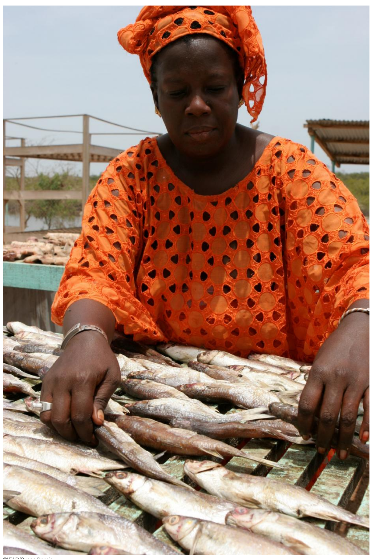
Senegal - Rural Micro-Enterprises Project (PROMER)