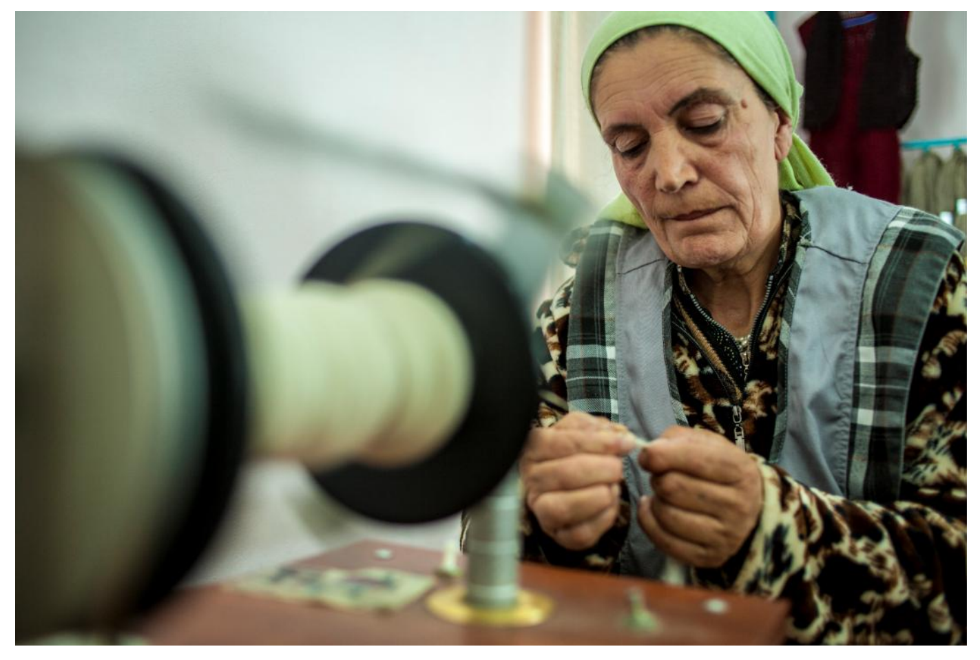
Tajikistan - Mobilizing Public Private Partnerships in Support of Women-led Small Business Development