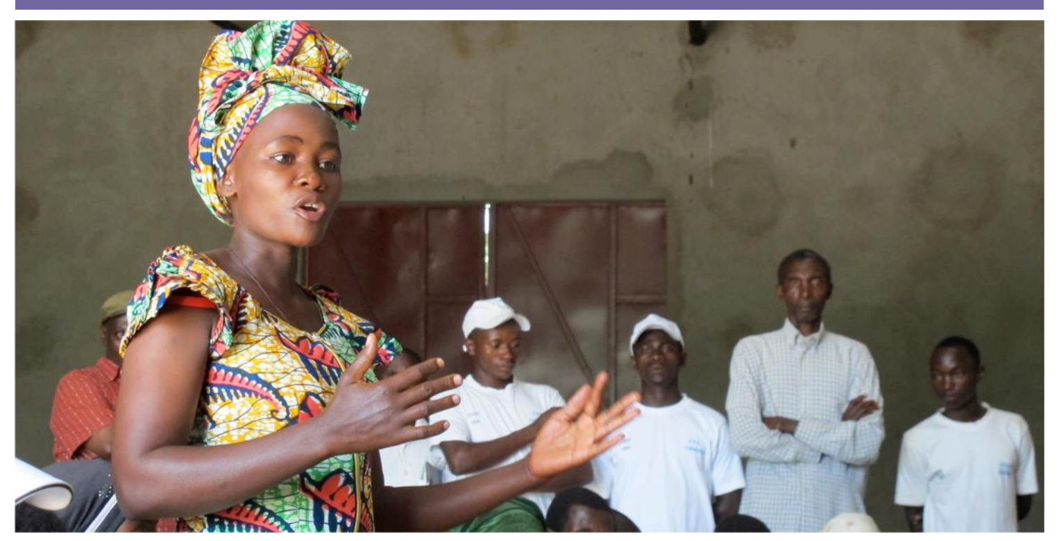
Burundi - Transitional Programme of Post-Conflict Reconstruction