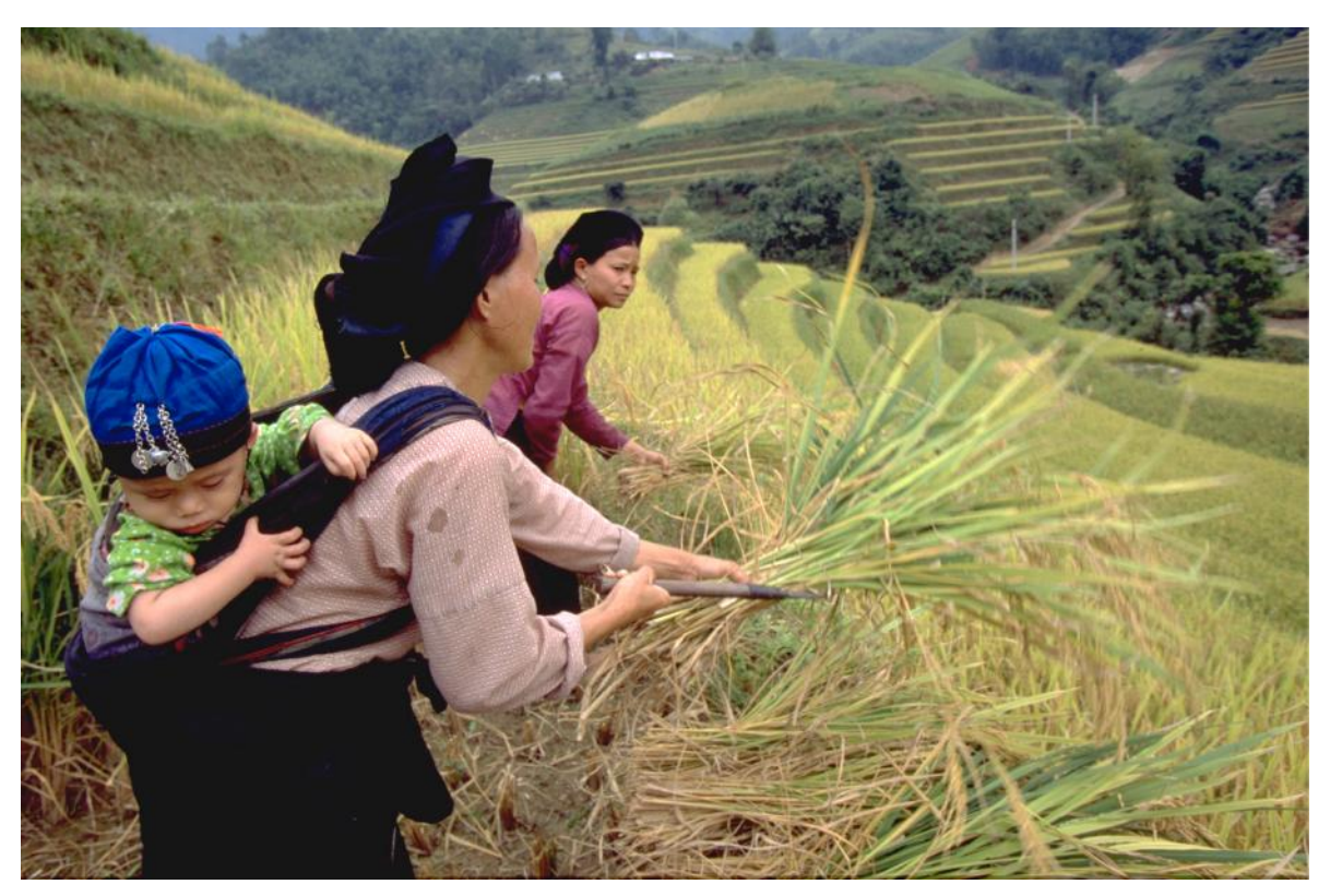
Viet Nam - Ha Giang Development Project for Ethnic Minorities

Young women are positioned differently than young men with regard to obtaining a livelihood from agriculture and access to natural resources, land, credit and information in order to make a living. It is important to harness the "youth dividend" for agricultural productivity and rural development, while recognizing that agriculture also offers young people opportunities for improved livelihoods and employment. Agriculture remains largely unattractive to youth because it is associated with poverty and drudgery. To attract young people, it must be profitable, competitive, mechanized and dynamic.