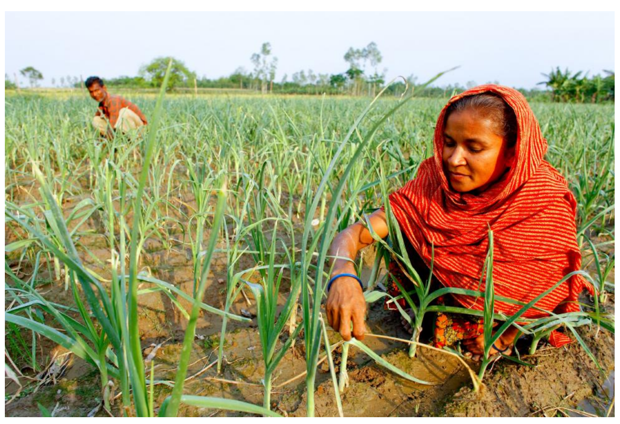
Bangladesh - Microfinance for Marginal and Small Farmers Project