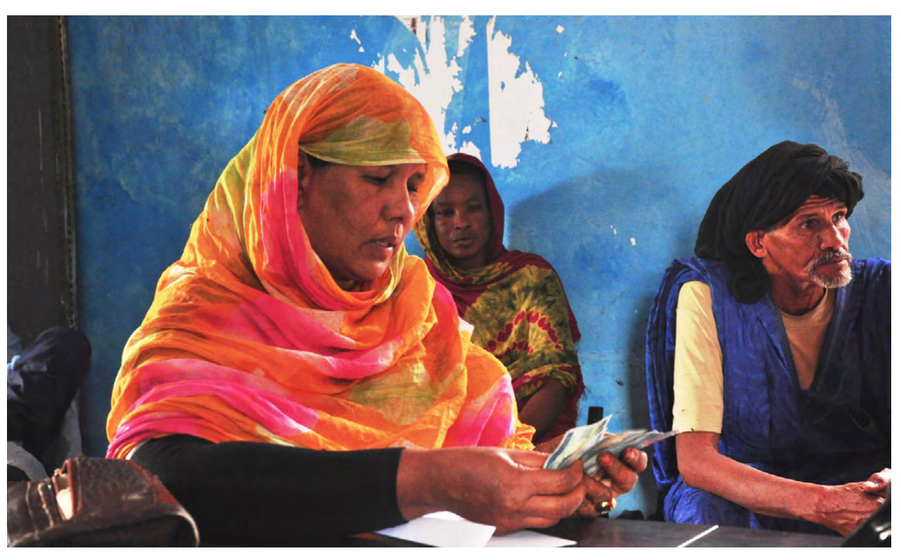
Women receiving their cash transfer in Monguel, Wilaya of Gorgol, Mauritania.

The rural poor tend to be family farmers, fishers and foresters, dependent on agriculture and natural resources for their livelihoods. They have little access to social protection or financial services, infrastructure, markets or innovative technologies and practices. Social protection has been recognized as an effective measure to reduce poverty, enhance food security and foster rural development. Investments in social protection can support rural populations in multiple ways, for instance, by increasing their access to health care, ensuring they receive adequate dietary intakes, allowing them to enjoy a minimum level of income security, ensuring they acquire quality education, and promoting and facilitating their engagement in decent and productive employment.