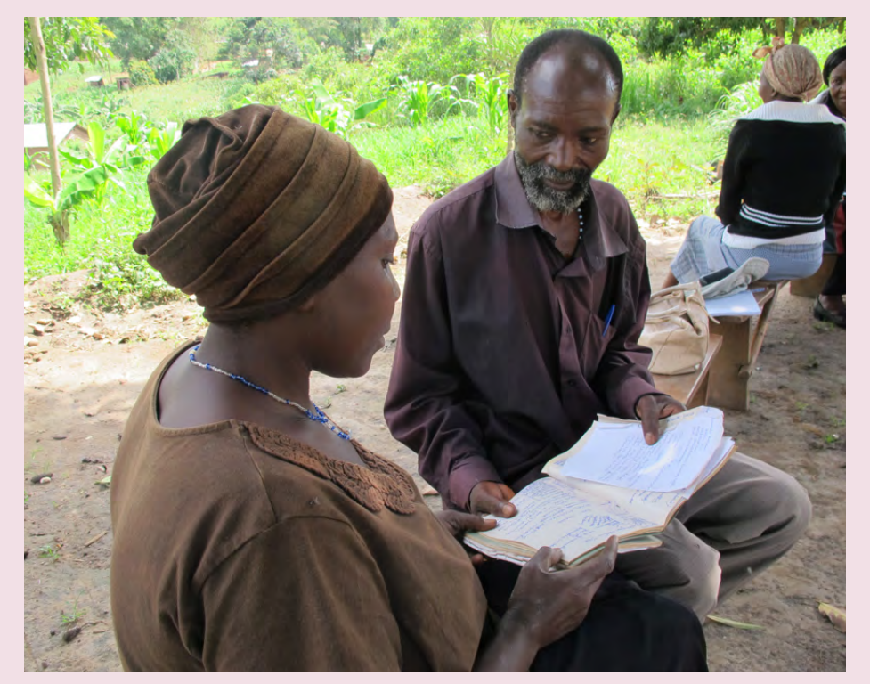
Participants in household mentoring in Uganda.

Expanding use of HHM has potential to reduce existing gender imbalances in food and nutrition security. HHM intervene directly in intra-household gender relations to strengthen smallholders' agency and efficacy as economic agents and development actors. Strengthening women's agency is a key mechanism for progressing towards collaborative, systemic farm management. This contributes to improved farm resilience in the face of climate change, strengthens food and nutrition security, and improves other development indicators.