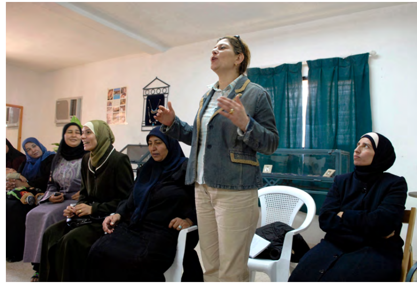
Women gather for a meeting at Wadi Mousa, Jordan.