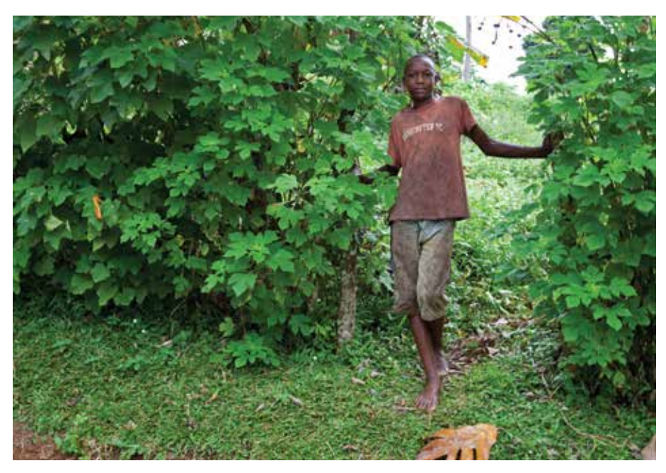
Sao Tome is one of the world's biodiversity hotspots, and one in ten plants are found nowhere else in the world.