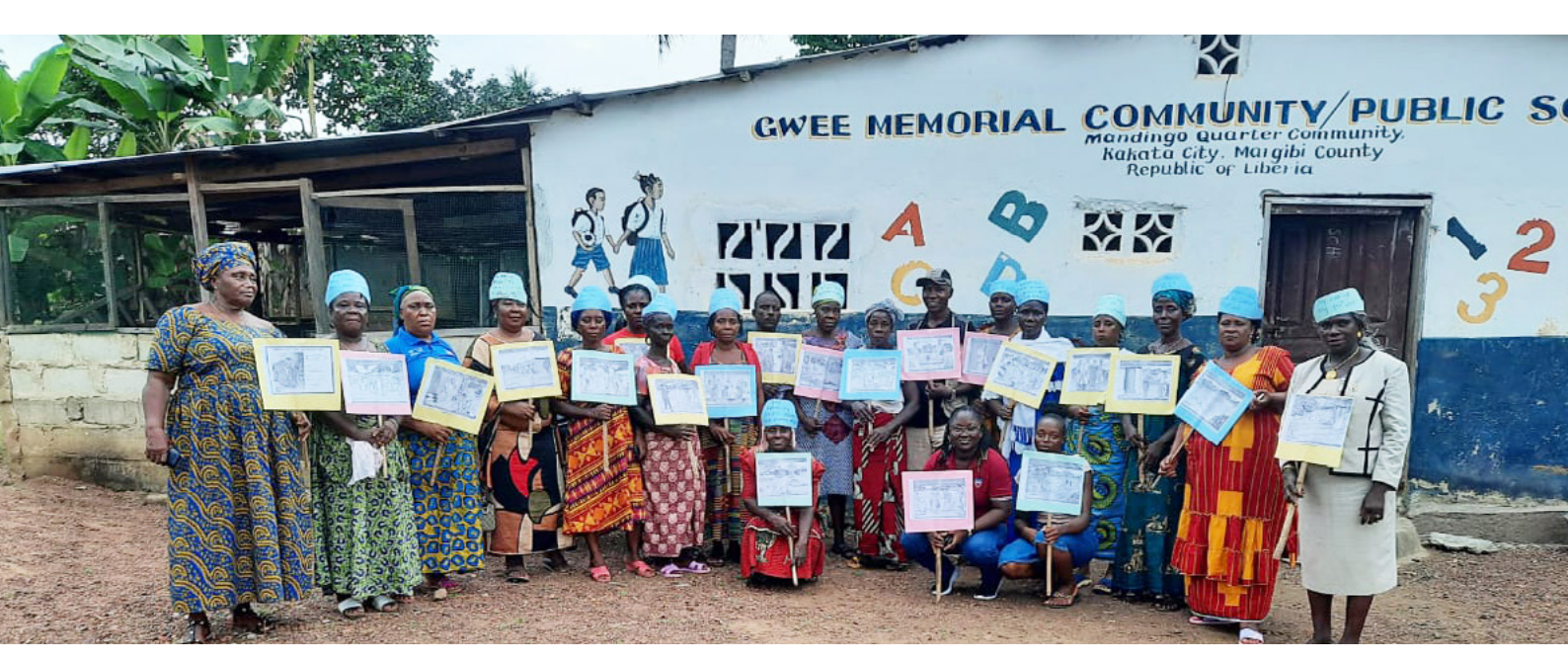
Photo: Women and engage in land rights awareness sessions in Liberia.