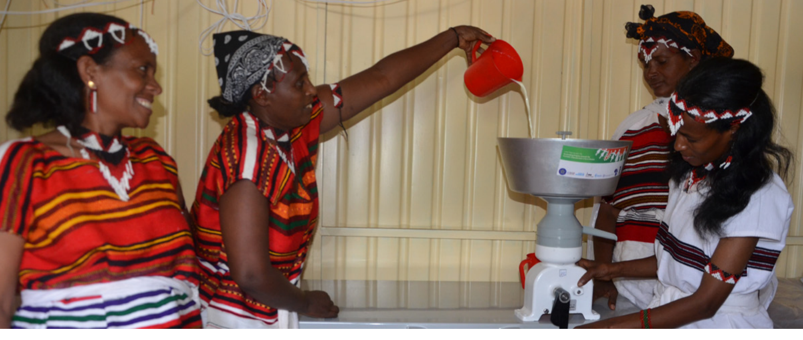
Photo: Women use the milk processing labour saving technologies provided by the JP RWEE.