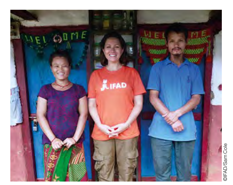
"Without permaculture, I would be nowhere. This is my life now."

Permaculture is a sustainable and self-sufficient farming approach that mimics the diversity and resilience of natural ecosystems. Permaculture can make a big difference, especially in countries that face land degradation. For example, in Nepal, where around 10 per cent of agricultural land is severely degraded, the IFAD-supported Adaptation for Smallholders in Hilly Areas (ASHA) project has helped small-scale farming communities apply permaculture practices. This is being achieved through practical, participatory training approaches such as farmer field schools. The results have been transformational for local farmers.