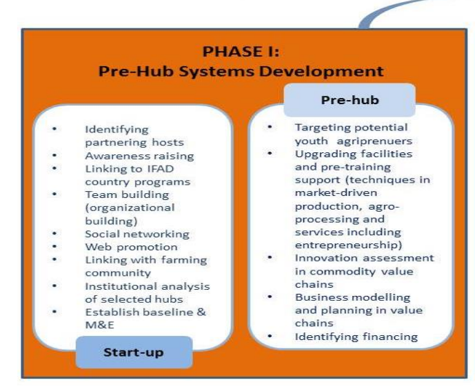
Figure 1 - Integrated Agribusiness Hubs