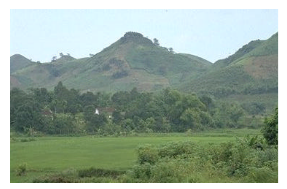
Participatory Resource Management Project in Tuyen Quang Province View of reforested hillside with rice paddies in foreground.

produced by the farmers themselves, and a self-management board for maintenance and protection has been set up in each commune.