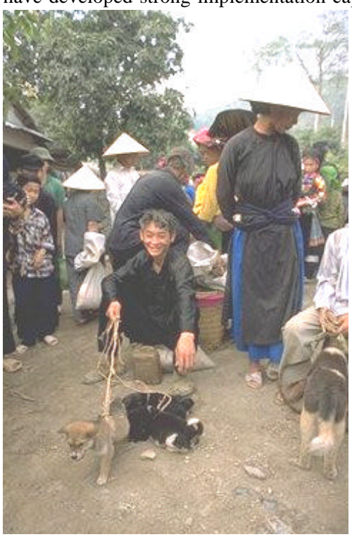
Ha Giang Development Project for Ethnic Minorities H'mong minority farmers at the Yen Minh market.

46. Role of mass organisations and NGOs. Mass organisations, such as the VWU and the FA, have developed strong implementation capacity and have been closely associated with IFAD projects