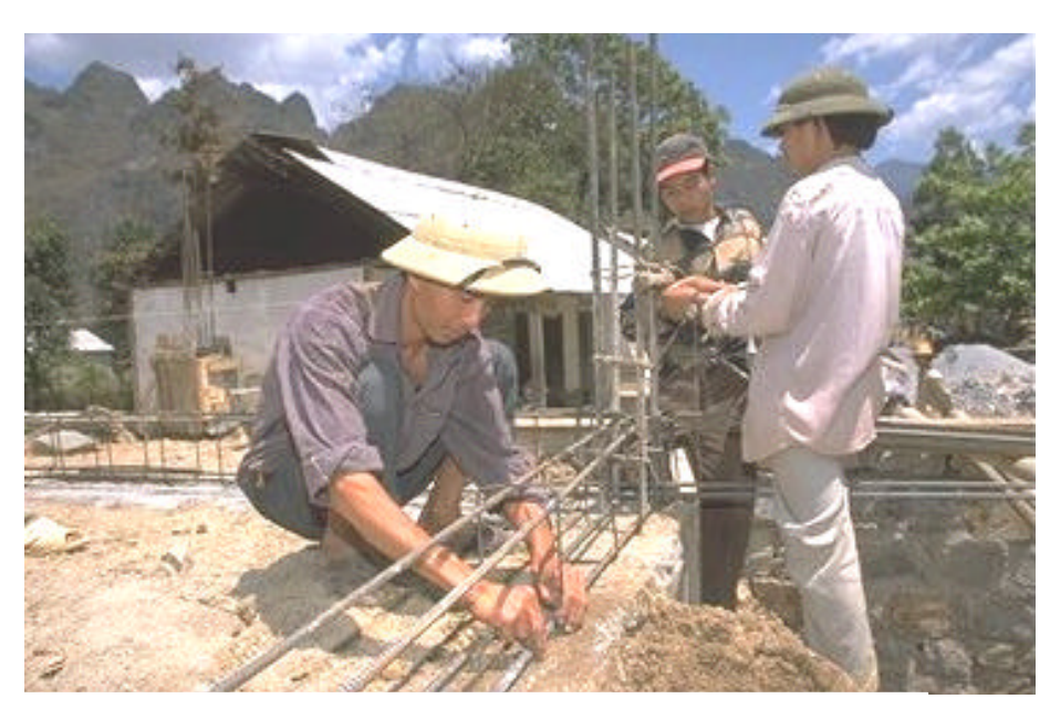
Ha Giang Development Project for Ethnic Minorities Construction workers build the project-funded district health centre in Yen Minh