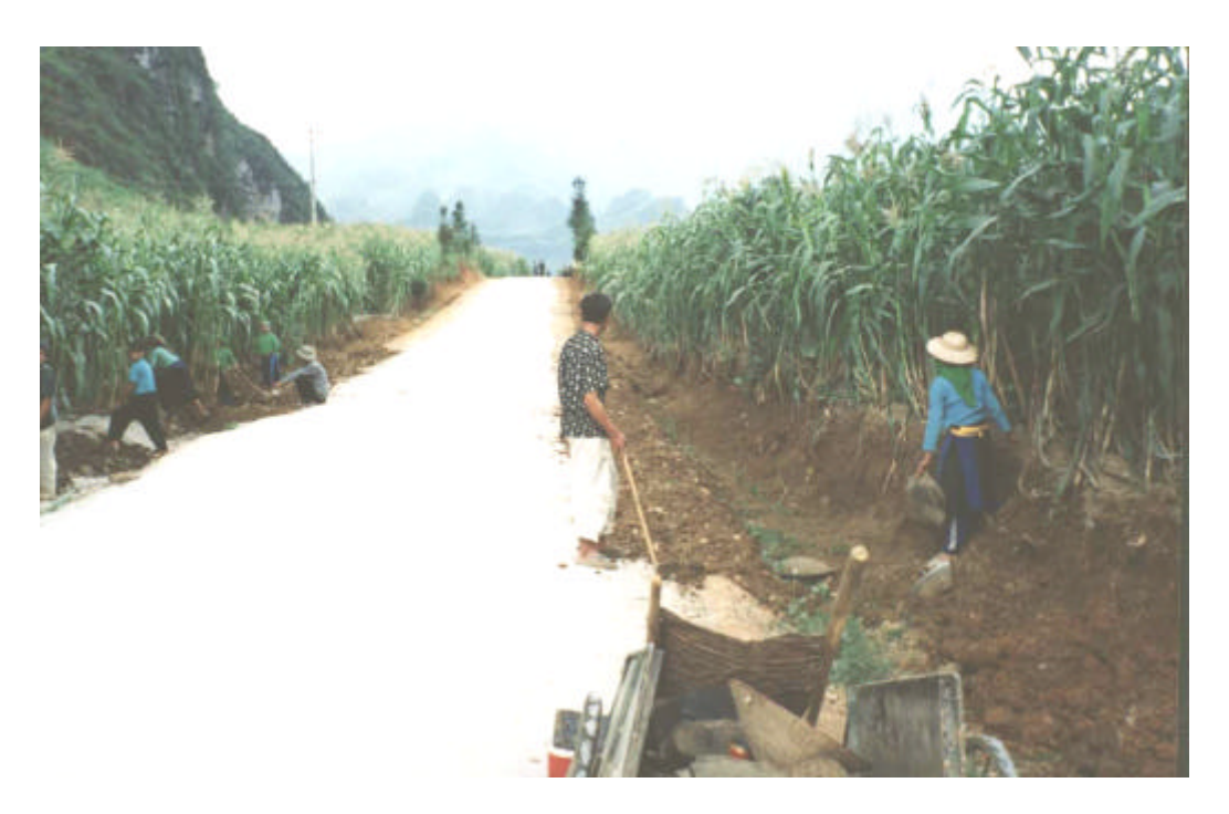
Agriculture Resources Conservation and Development Project in Quang Binh Province Rehabilitation of rural road.