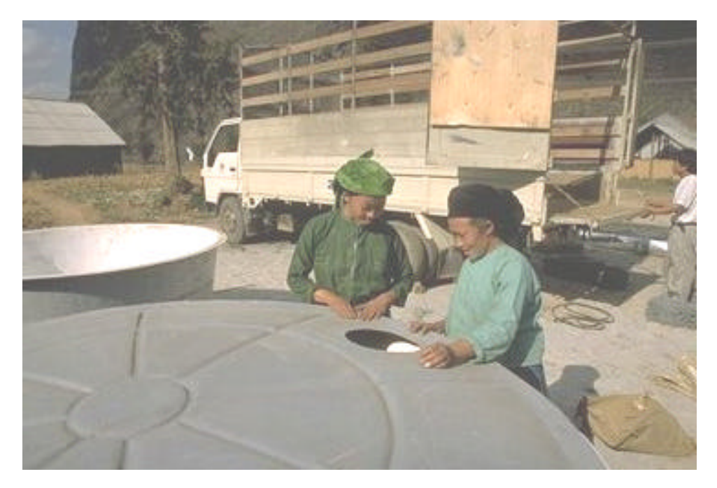
Ha Giang Development Project for Ethnic Minorities Hmong minority workers unload and examine water tanks

33. Participatory research and extension. The successful integration of agro-forestry and livestock into cropping systems in the uplands by the participatory extension service has validated the relevance of both the PRA methodology and multi-disciplinary and farming systems approach to developing sustainable livelihoods, rather than optimising land-based production in the short-term. Experience shows that the extension system, backed by a system of applied and adaptive research, has been effective in generating appropriate technical packages and messages and in interacting closely with farm households that provide to both researchers and extension workers local knowledge and feedback on the effectiveness of the innovations and technologies being tested. This is highly important in orienting research and extension to development activities that are relevant and acceptable to people living at the grass-roots level. It is recommended that Projects press for the strengthening of the demand-driven participatory research and extension system through additional investments in training of staff and essential infrastructure, improved access to micro-credit at market