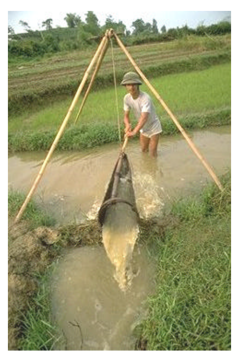
Participatory Resource Management Project in Tuyen Quang Province A farmer working in an irrigation canal.

26. Financial Services. The credit programme faced serious structural and procedural problems that restricted its impact on project beneficiaries significantly. The cumbersome processing procedures, the high cost of making small loans, the collateral requirements and the perceived high risks of small loans inhibited the involvement of commercial or state banks in lending to poor farmers at a large scale. Even in Tuyen Quang, where the flow of credit to the poor from VBARD has been good, the group capital was not enough to meet the short term or medium term consumption/production credit needs of their members on a sustained basis. Attempts to satisfy more households have resulted in a thin spread of credit and only very few beneficiaries have been able to obtain a second loan. Despite high repayment rates, there was very little mobilisation of savings and very little in the diversification of investments, most credit being used to purchase pigs and/or buffaloes. Over 70 percent of rural households depend on informal sources for credit, paying interest rates that are two to three times higher than those charged by formal financial institutions. Apart from limited presence of formal banking institutions in rural areas, inability to offer collateral explains limited access to formal finance by the rural poor. There is a widely acknowledged need to build up a basic structure of rural financial services responsive to needs of local communities.