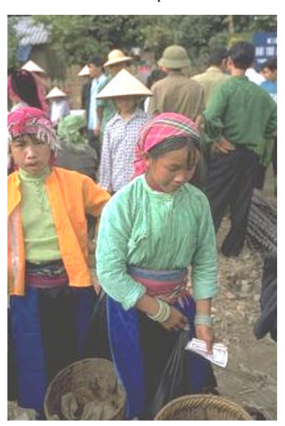
Ha Giang Development Project for Ethnic Minorities Hmong minority farmers at the Yen Minh market. Ethnic minorities come from around the district to buy, sell, eat and socialize.

sectoral PRA used in other projects. Primarily, PRA methodology was used to determine the content of research and extension priorities in instituting a problem-solving and demand-driven approach to agricultural extension. PRA methodology was also employed for wealth ranking in the project area as a targeting instrument, whereby poorest households are identified by the villagers themselves through classifying households into four or five categories based on their own criteria. Integrated participatory evaluation exercises have been institutionalised in Tuyen Quang, with monitoring of poverty status and village work plans. A variety of self-help groups have been formed which are involved in planning and managing micro-irrigation and drinking water schemes, access to credit, road programmes, sand dune fixation, forest protection and agricultural extension activities. Water user groups function successfully and the sense of ownership by beneficiaries is real. There must be self-reliant and well-trained labour crews, or in their absence device an alternative arrangement, to operate and maintain project schemes to ensure post-project continuation of benefits. Participatory processes can be sustained beyond the project period only if they are institutionalised within existing structures.