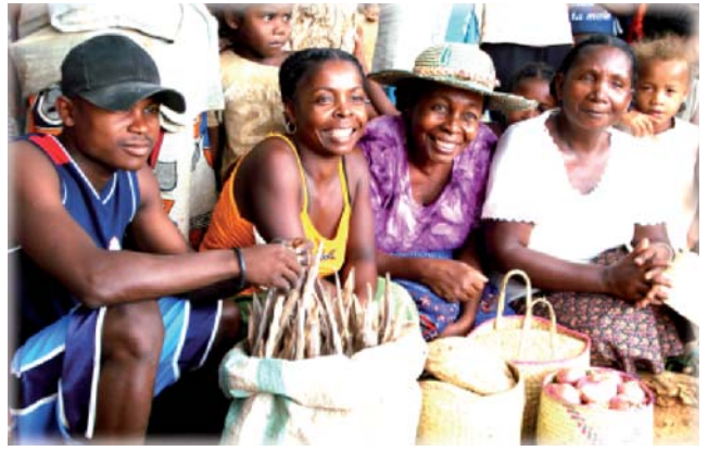
Upper Mandraré Basin Development Project, Phase II. Woman in market square sells onions in Marombe village, Madagascar

In their programme in Madagascar, IFAD and the Government established the Improvement in the Monitoring-and-Evaluation and Knowledge Management System platform, known by the acronym SEGS (from the French title Amélioration du système de suivi-évaluation et de gestion des savoirs) or ZARAFIDA (from the Malagasy word zara, meaning 'shared' + FIDA or IFAD). This platform is based on monitoring and evaluation systems established under individual projects and on the use of information and communication technology. It is composed primarily of an electronic library containing the documents of each project, which are fed into a common data base according to standardized indicators. It also contains a series of case studies on the successes or failures of projects. In this way it allows information from individual projects to be extracted in order to carry out analyses or syntheses, produce maps, photographs or graphics, or write articles. Making use of other initiatives in the region, the SEGS/ZARAFIDA platform allows field experience in Madagascar to be disseminated in other countries.