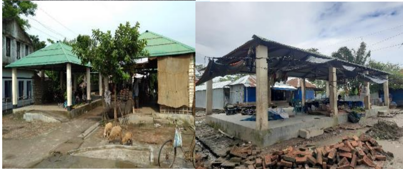
Munshiganj Bazar, Shyamnagar, Satkhira