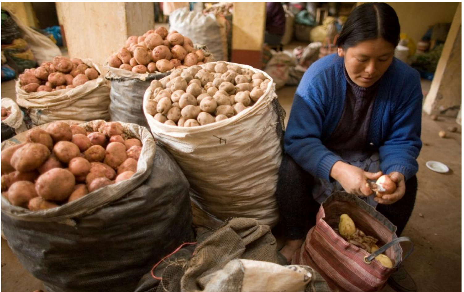
Peru – Management of Natural Resources in the Southern Highlands Project