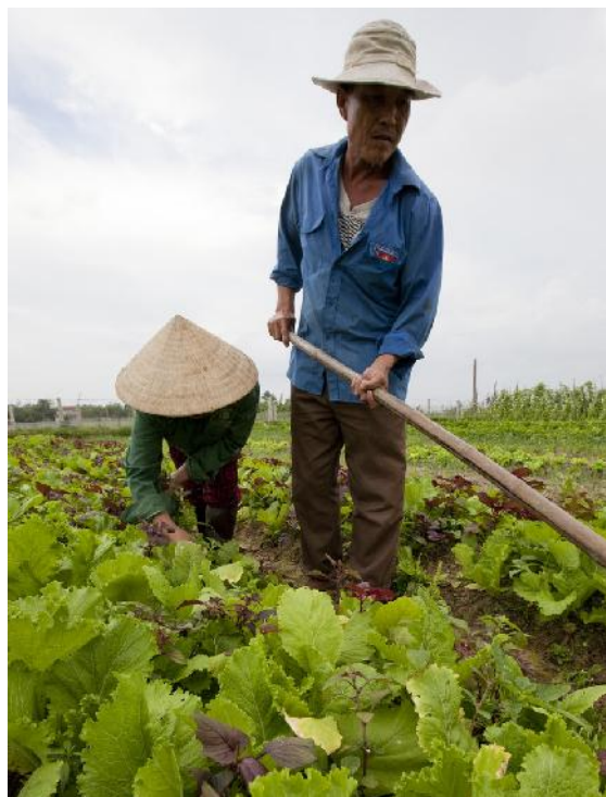
Viet Nam – Programme for Improving Market Participation of the Poor