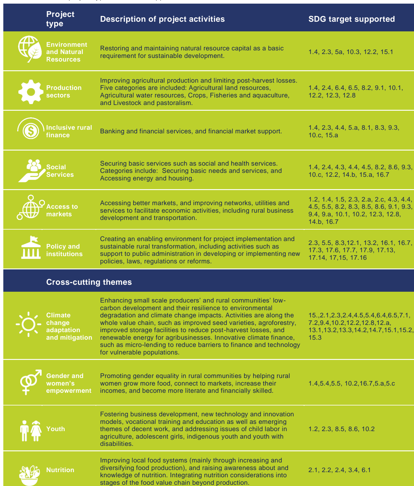
Table 1: IFAD project types and SDG supported

IFAD-supported projects are of various types in several sectors within the agricultural space. In line with its Strategic Framework, IFAD contributes most significantly to the eradication of poverty and hunger (SDGs 1 and 2), as well as to the gender equality (SDG 5) and reduced inequalities (SDG 10), decent work and economic growth (SDG 8), action on climate change (SDG 13) and the environment (SDG 15). Other SDGs are also supported as shown in table 1. In total, IFAD supports directly or indirectly 16 out of 17 SDGs .