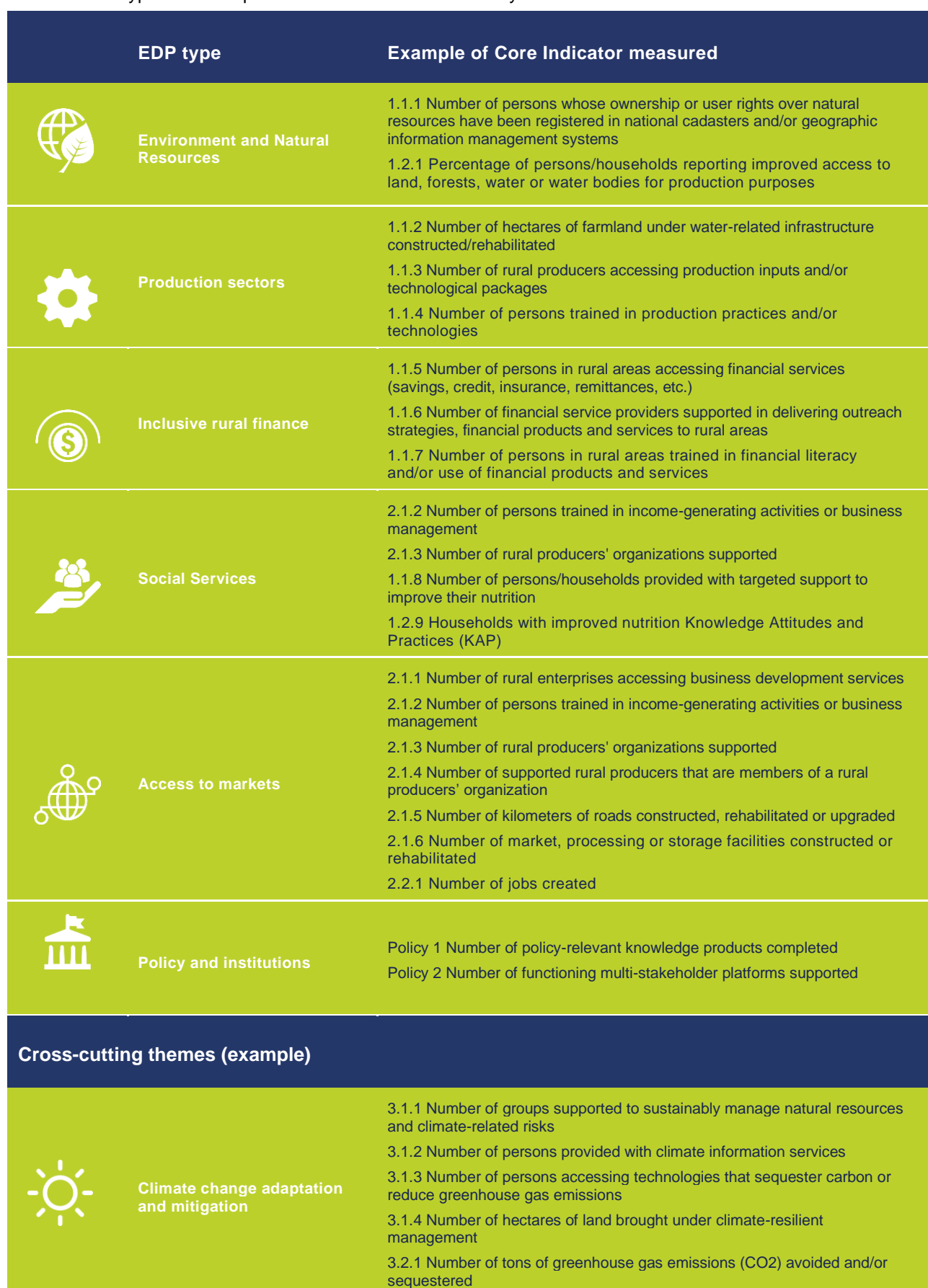
Table 3: EDP type and example of Core Indicator measured by IFAD